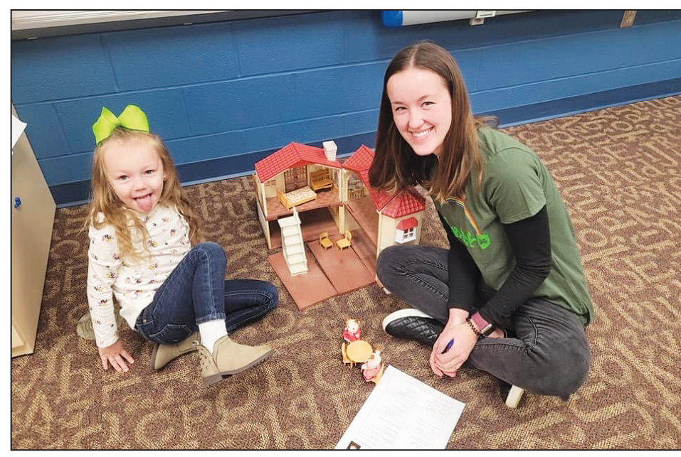
Starting next school year, Strasburg Elementary will be welcoming new students in preschool and in kindergarten. Registration for both classes was held in April. We met lots of excited new tigers!