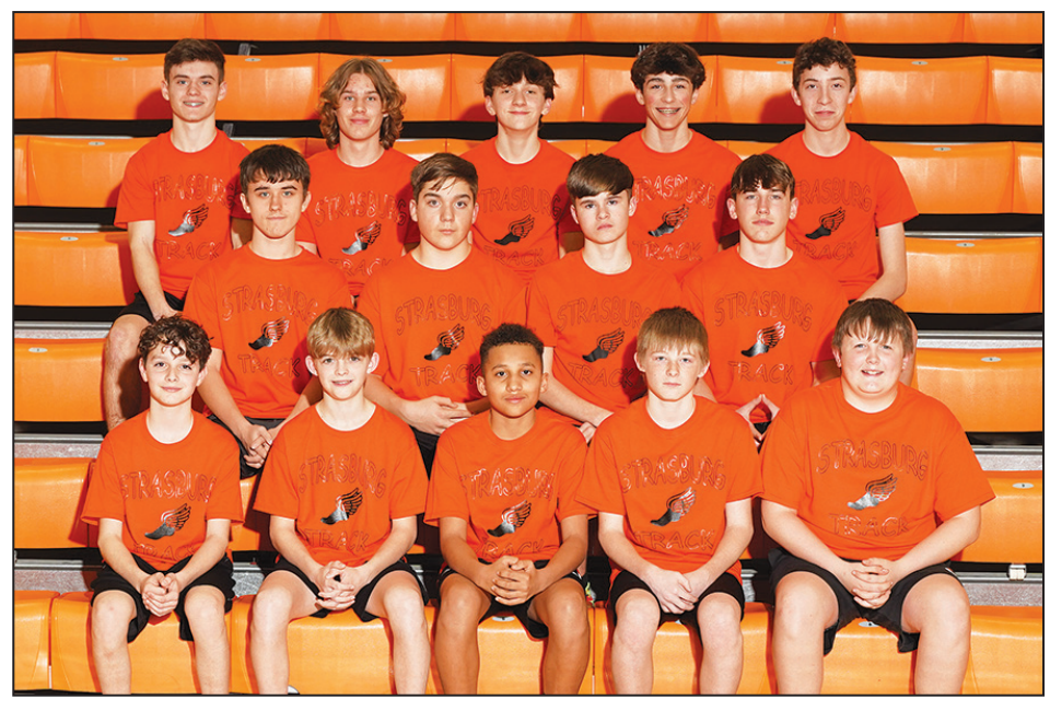
Middle School Boys Track