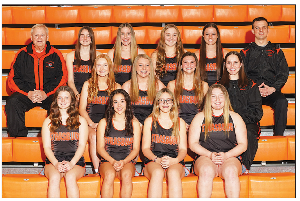
High School Girls Track