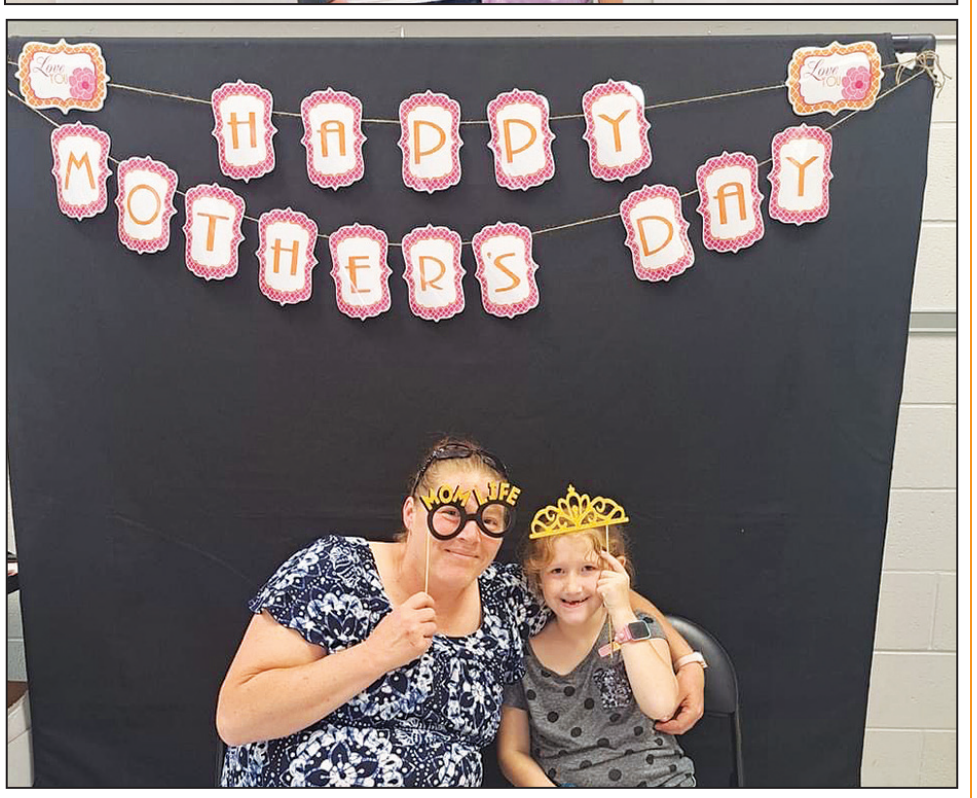
Donuts with Dudes and Muffins with Moms continue to be highlights of the year! Students get to invite the special men and women in their lives to school to share breakfast with them and their friends.