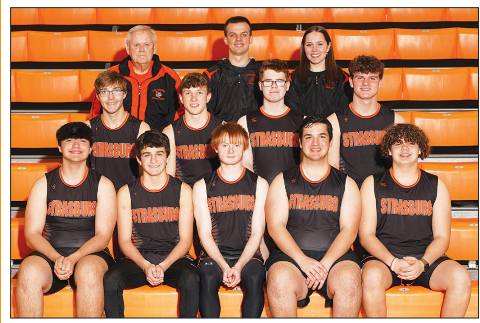
High School Boys Track