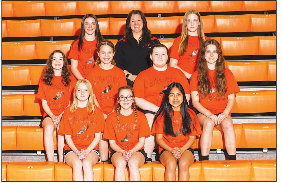
Middle School Girls Track