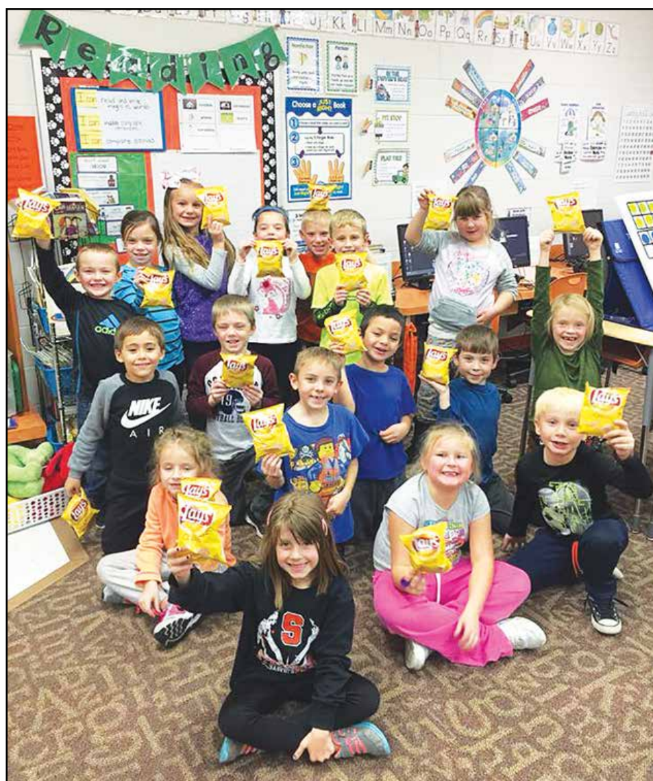
School data shows the PBIS program continues to improve students' behavior and completion of work. Incentives include Zero Club Parties, Daily Shout-Outs, Keychains, Ten-Day Rewards, and Potato Chip parties.