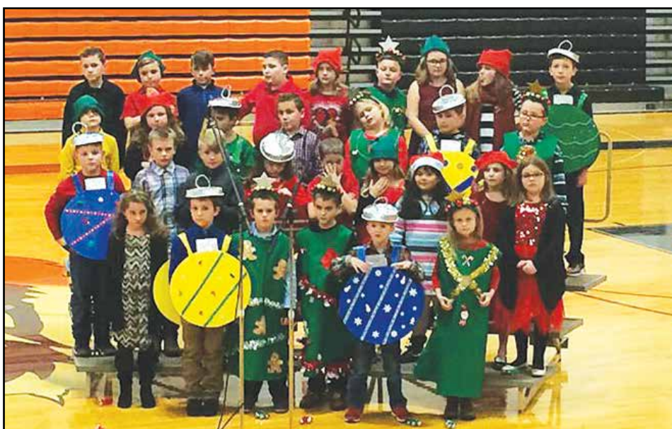
The second and third-grade classes entertained a large crowd on December 18 with their holiday program. The students also performed for the Widows Helping Widows Group, who created the wonderful costumes worn in the program. There was even a special visitor from the North Pole!