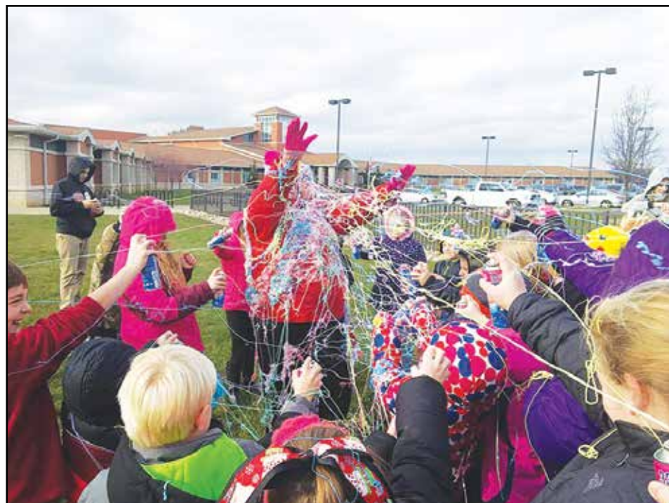
The PTG sponsored a pretzel fundraiser which raised over $7,000 for needed school supplies. Students who sold two boxes of pretzels enjoyed the opportunity to Silly String the principal.