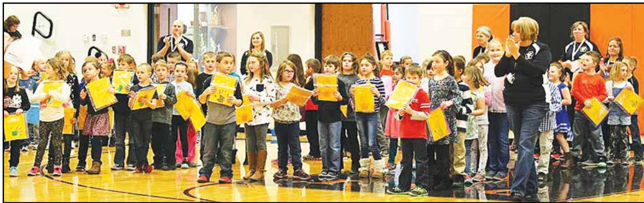
Over 300 "grand" guests attended the third annual event, which included lunch, poetry, and activities.