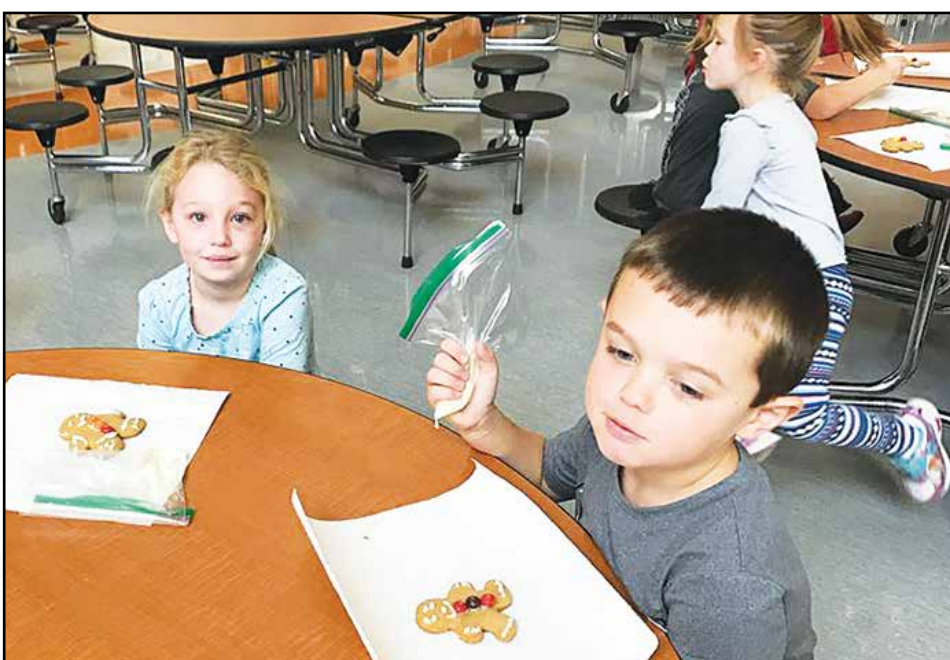
The kindergarten classes enjoyed decorating (and sampling!) their very own gingerbread cookies.