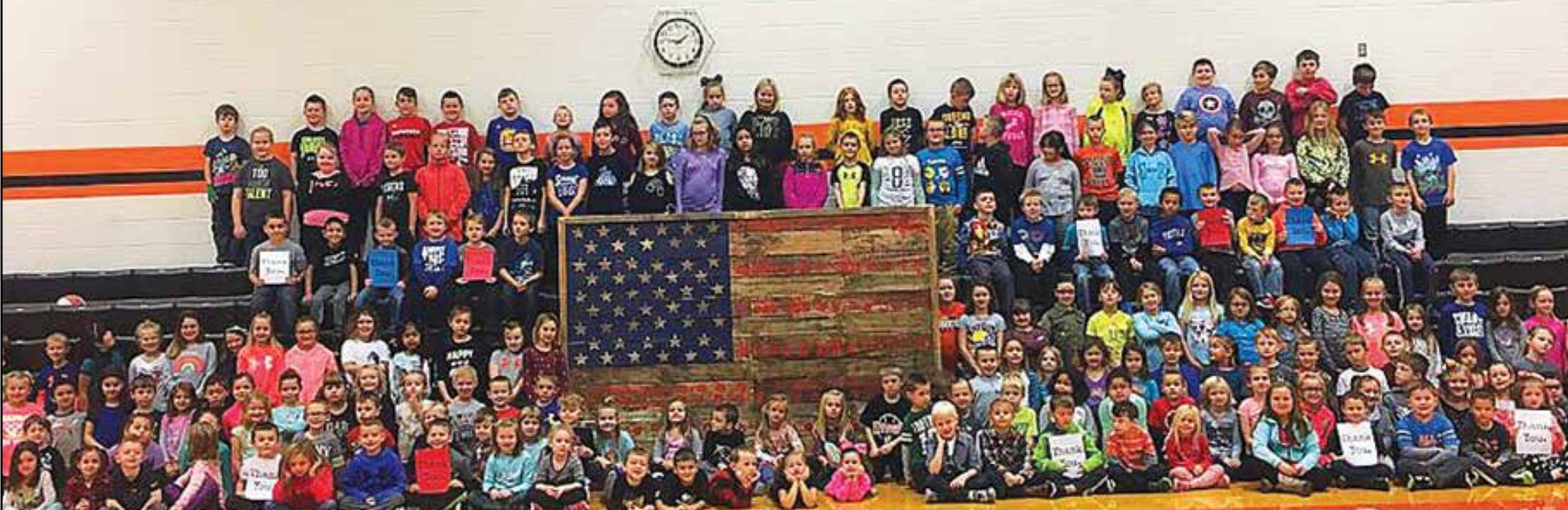
The elementary hosted its third annual Veterans Day breakfast and program on Friday, November 10. Over 100 guests attended. This year a large wooden flag constructed from our K-2 students' hand-prints was created, and became a permanent fixture in the building. Thanks to the generosity of our students, we also donated $125 to Disabled American Veterans.